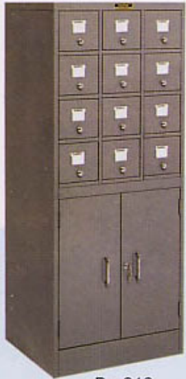
B - 212