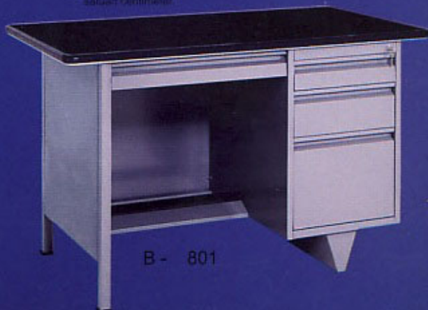
B - 801