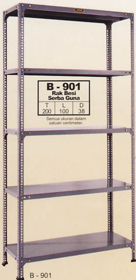
B - 901