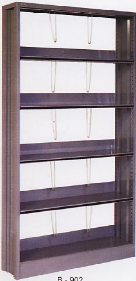
B - 902

BROTHER the symbol of the genuine BROTHER® product