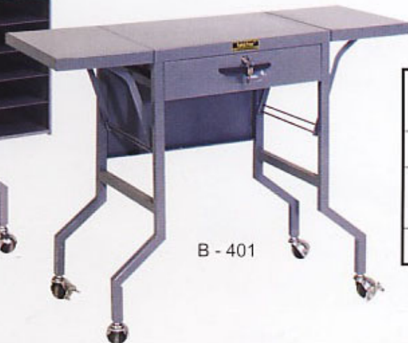
B - 401