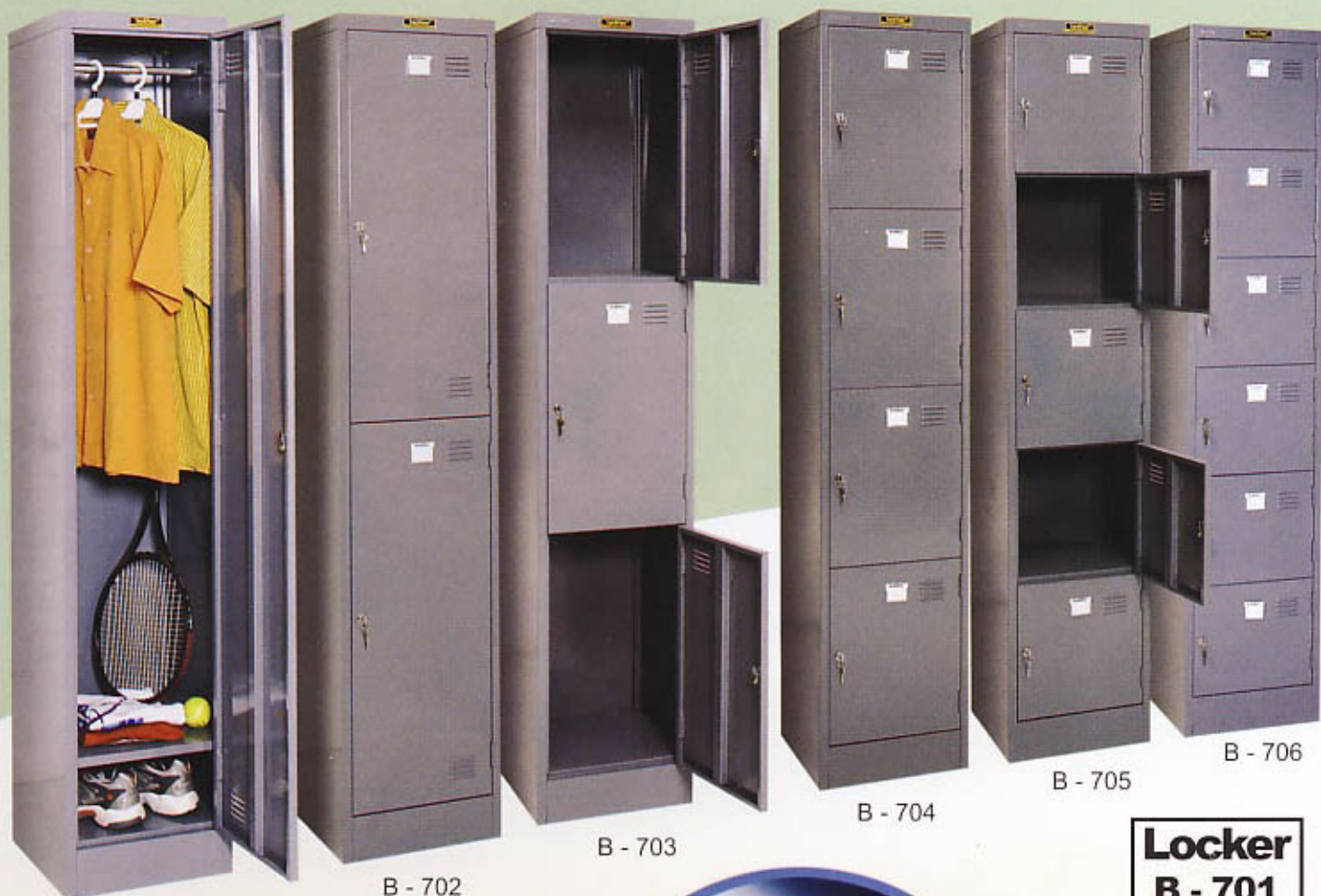
B - 701