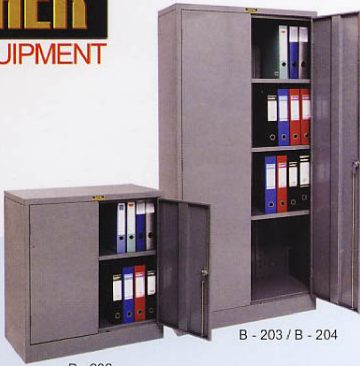
B - 206