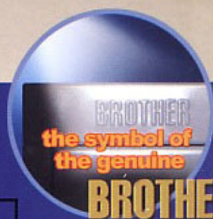
B - 206