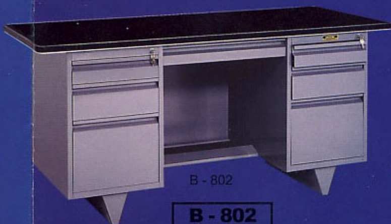
B - 802