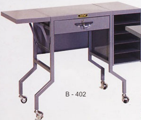
B - 402