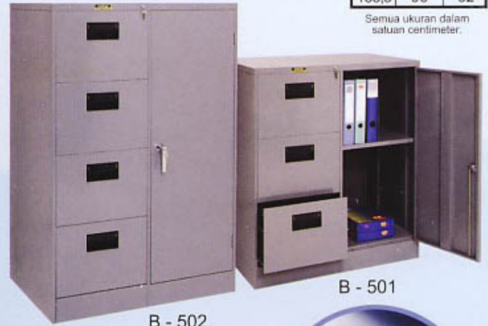
B - 502