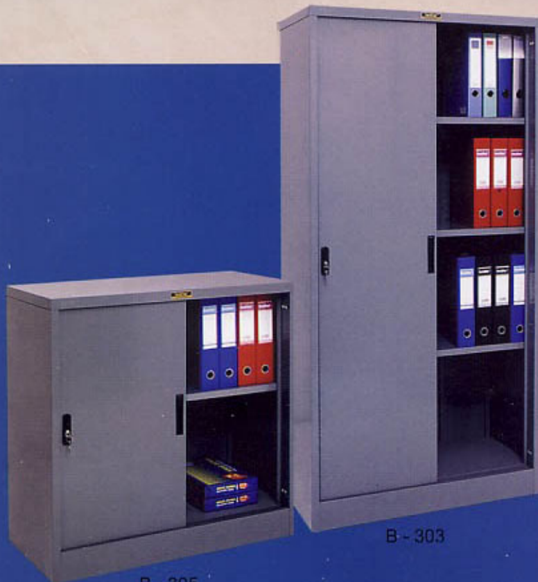
B - 305