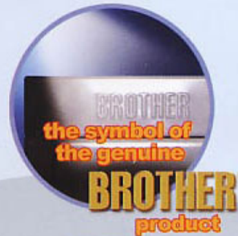
B - 501

anti corrosion powder coating safety lock strong