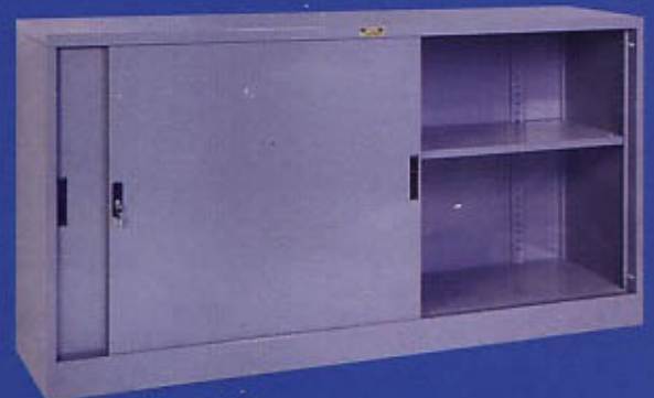
B - 307