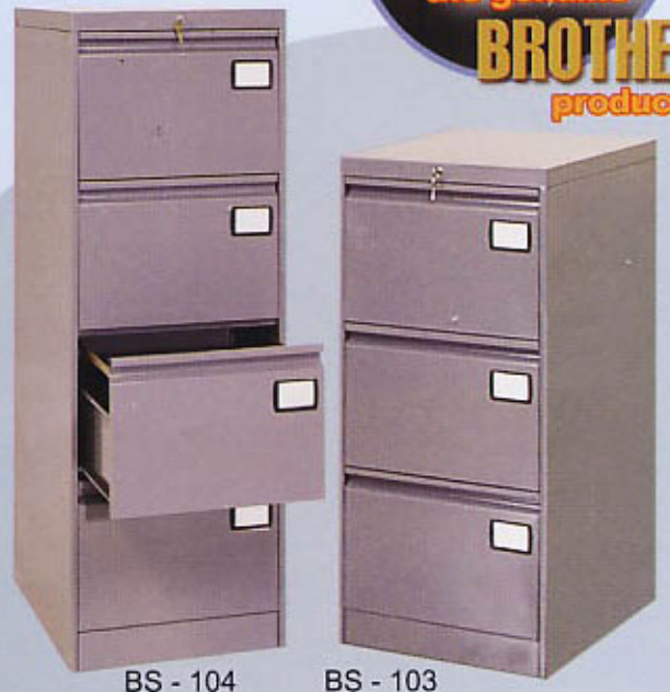
BS - 104