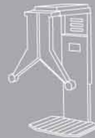
AKCPU1 (CPU HOLDER)