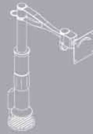
ALA222 (MONITOR BRACKET)