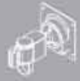
ALA2AV0 (MONITOR BRACKET ARM)