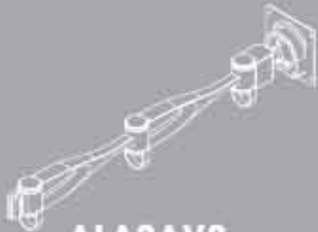
ALA2AV2 (MONITOR BRACKET ARM)