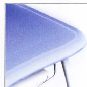
SAFE ROUND EDGES