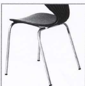
POWDER COATED FINISH