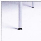
ADJUSTABLE FLOOR LEVELING