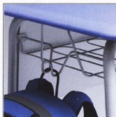
BAG HANGER ON TWO SIDES